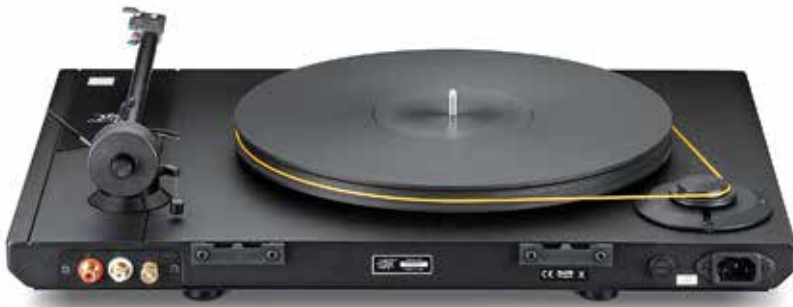
ABOVE: As with the UltraDeck, there's no external PSU here but a direct AC mains power connection. Tonearm wiring is terminated in RCA outputs and a ground post

being incremental. You know the drill because it is the definition of an upgrade path. The sheer wonder of the StudioDeck vs the UltraDeck is how perfectly it represents the gains without tickling the feet of the Law of Diminishing returns.